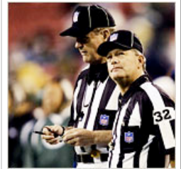
Roberts: Instant Replay Draws Blood