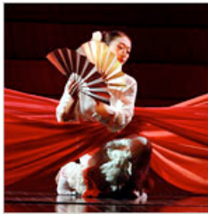
Madama Butterfly Is Ready for Her Close-Up