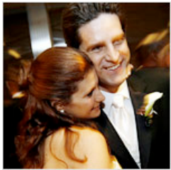
Weddings & Celebrations »