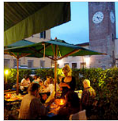
The Riches of Lucca